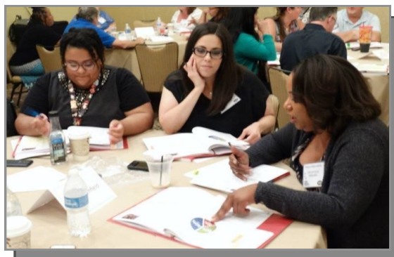
(Clockwise from top left) Teachers from: Cesar Chavez, J. R. Davis, and C. O. Greenfield